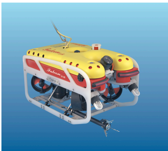
Tools and survey kit can easily be added to the Falcon DR and changed for different missions.

Rapid role-change during operations is a particular benefit for them. Its intelligent electronics system offers a ‘plug and go’ simplicity that allows up to 128 devices to be added and changed easily – essential during Homeland Security missions.