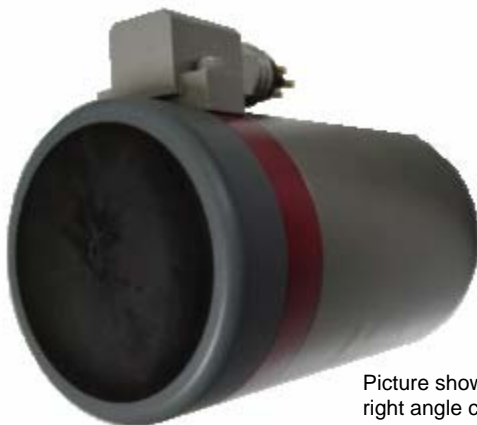
Picture shown with optional right angle connector.

The Imagenex Model 881A Echo Sounder is a completely self-contained echo sounder with a serial output. It is mounted in a pressure-proof housing with an underwater connector for use in depths up to 3000 meters (10000 feet). It can be used as a standard echo sounder or with digitized first returns only. Its requirements are minimal, needing only a power source and a digital interface to an external device such as a personal or laptop computer. It uses the 881A control/data format and can be used with the 881A Multiplexer.